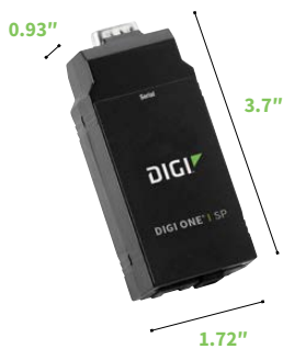
DigiOne® SP - FRONT

For a full list of accessories, visit www.digi.com